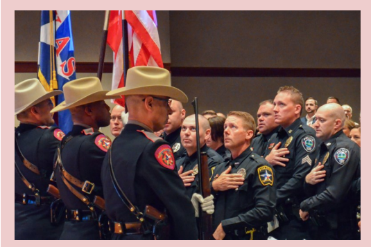
Pledge of Allegiance with DPS Color Guard