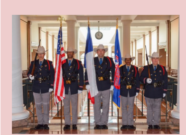
DPS Color Guard