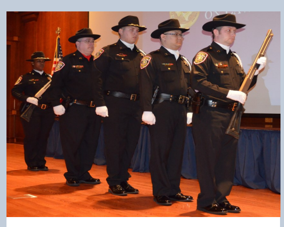
Tarrant County Sheriff's Office Color Guard