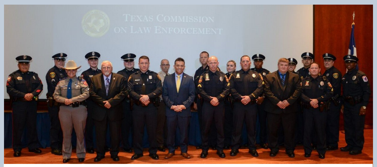
2016 Award Recipients