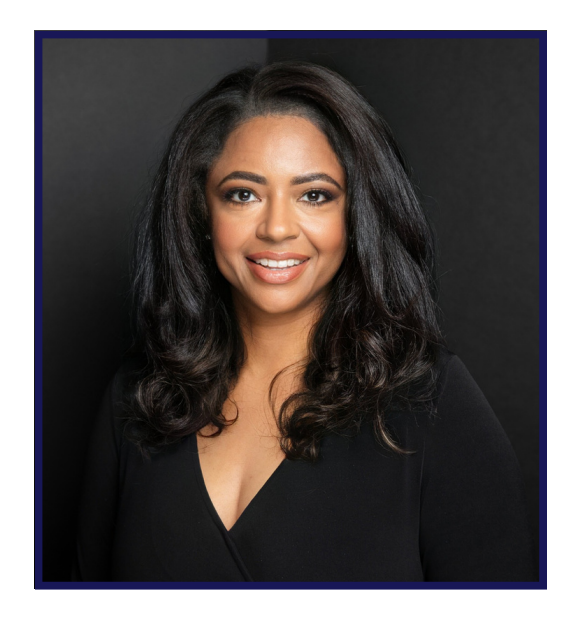
August 5, 2022 -January 31, 2024